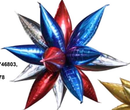
Created with 27" Silver #746803, Ruby Red #753733, and Sapphire Blue #775278