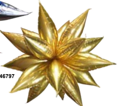
Created with 27" Metallic Gold #746797